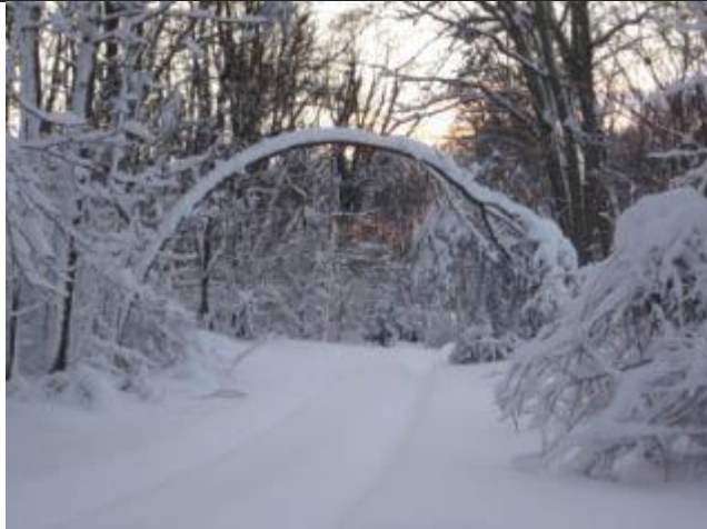
After a fresh 16-26 inches, snow on the ground was over 3 feet with drifts over 5 feet high