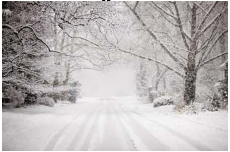
Storm Image Gallery

Introduction to the 10 Biggest Snowstorms of All Time