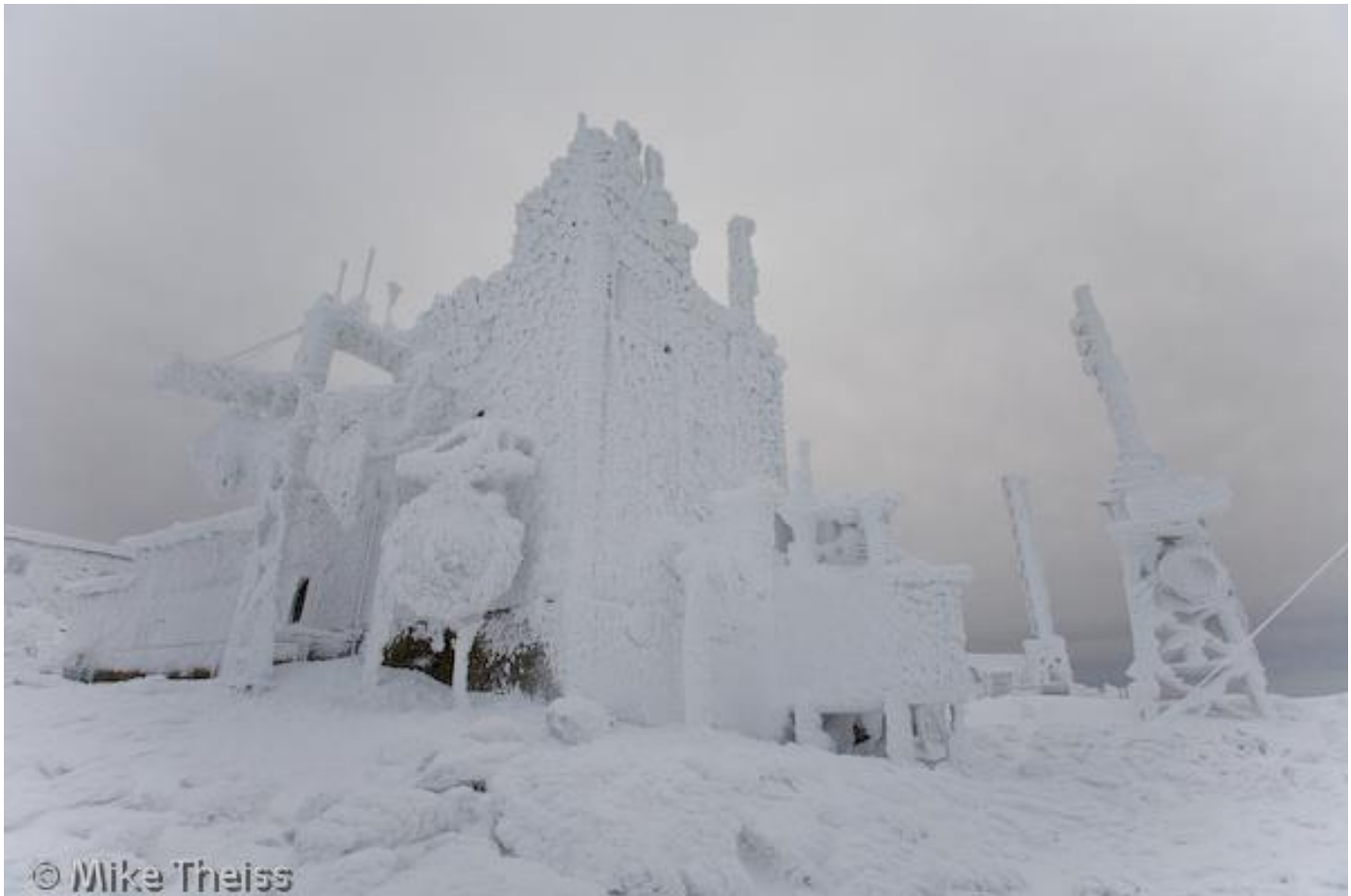
Figure 1. Instruments coated with rime ice on the summit of Mt. Washington, New Hampshire. Image credit: Mike Theiss .

The 6,288-foot peak of New Hampshire's Mount Washington is a forbidding landscape of wind-swept barren rock, home to some of planet Earth's fiercest winds. As a 5-year old boy, I remember being blown over by a terrific gust of wind on the summit, and rolling out of control towards a dangerous drop-off before a fortuitously-placed rock saved me. Perusing the Guinness Book of World Records as a kid, three iconic world weather records always held a particular mystique and fascination for me: the incredible 136°F (57.8°C) at El Azizia, Libya in 1922, the -128.5°F (-89.2°C) at the "Pole of Cold" in Vostok, Antarctica in 1983, and the amazing 231 mph wind gust (103.3 m/s) recorded in 1934 on the summit of Mount Washington, New Hampshire . Well, the legendary winds of Mount Washington have to take second place now, next to the tropical waters of northwest Australia. The World Meteorological Organization (WMO) has announced that the new world wind speed record at the surface is a 253 mph (113.2 m/s) wind gust measured on Barrow Island, Australia. The gust occurred on April 10, 1996, during passage of the eyewall of Category 4 Tropical Cyclone Olivia.